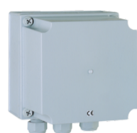
Power Supply Unit 9.3388.00.000

Provides power, for Ombrometer and Precipitation Transmitter.