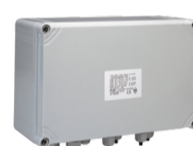
Power supply Unit 9.3389.10.000

For the power supply of wind speed transmitters, wind direction transmitters or combined instruments.