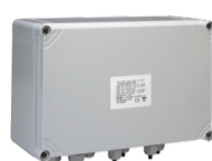
Power supply Unit 9.3389.10.010

For the power supply of wind speed transmitters, wind direction transmitters or combined instruments.