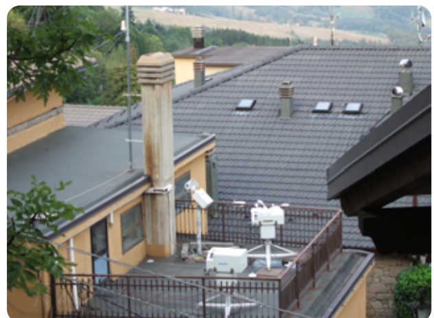
Brewers on site in Italy

The Italian Air Force can now be confident that the Ozone and UV measurements made by their Brewers are accurate and can be confidently supplied to the World Ozone and Ultraviolet Data Centre (WOUDC) in Canada ■