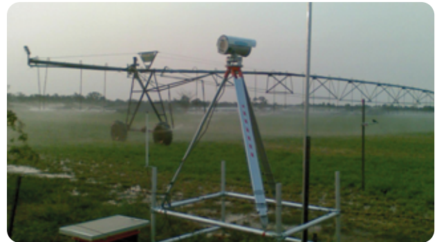
LAS measuring over lucerne irrigated by centre pivot sprinklers. The smoke in the background comes from the tragic Black Saturday bushfires in February 2009

districts will facilitate the application of satellite remote sensing ET algorithms to the major irrigated crops of the region and, also benefit the red gum forests.