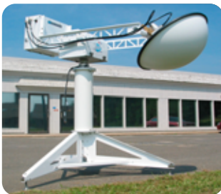
Each 2AP sun tracker is fitted with a cold weather cover, heater kit, tripod stand and height extension tube.

6 ProSensing Inc. of Amherst, Massachusetts, USA was founded in 1982. During the early 1990's the company began designing and building remote sensing instrumentation for a wide range of environmental research applications. ProSensing, with its highly qualified technical staff, has successfully deployed equipment all over the world.