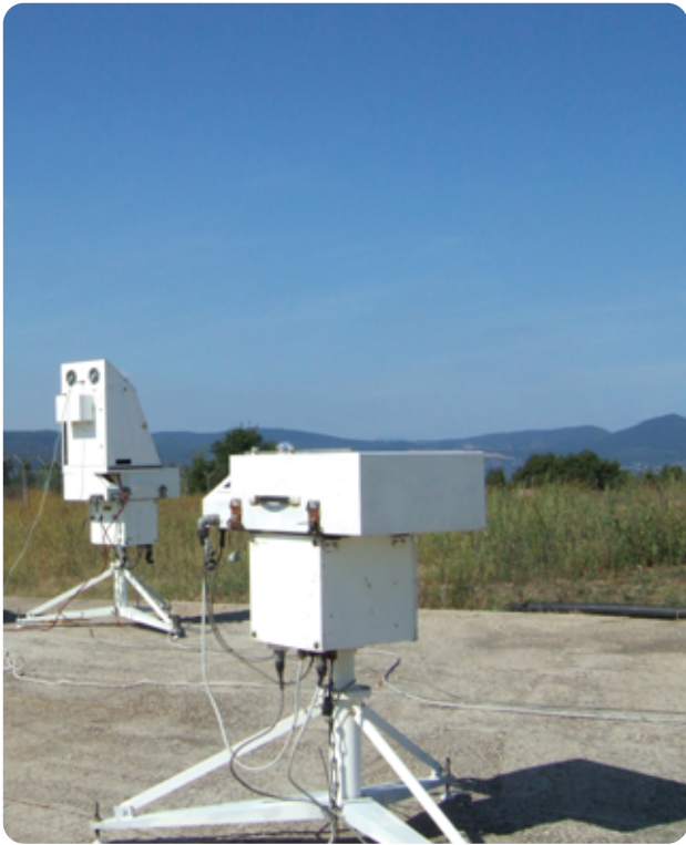
Brewers being calibrated

One of the products manufactured by Kipp & Zonen is the Brewer spectrophotometer. This instrument measures the concentration of the Ozone layer and can perform high accuracy spectral UV scans. The Brewer is a very complex instrument that requires regular maintenance and calibration. As the manufacturer, Kipp & Zonen, has the knowledge, parts and test equipment to service, repair and calibrate all models of Brewer on site or at the factory in Delft, the Netherlands.