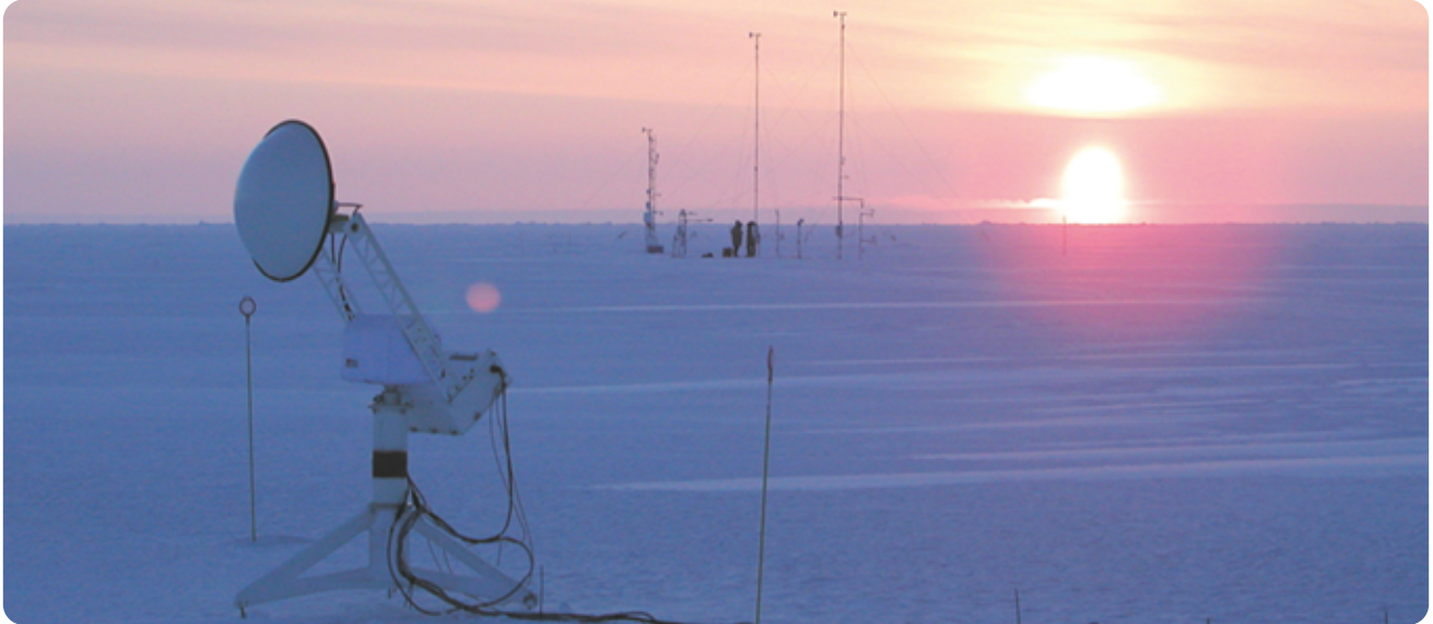
Measurement of the physical properties of snow-covered sea ice for geophysical and climate variable inversion estimation.

Kipp & Zonen's 2AP Sun Tracker has become an industry standard for longevity and reliability in the measurement of solar radiation. The 2AP's high power motors and precision gear drives were what ProSensing Inc. was looking for when developing a steerable remote radar system to study sea ice.