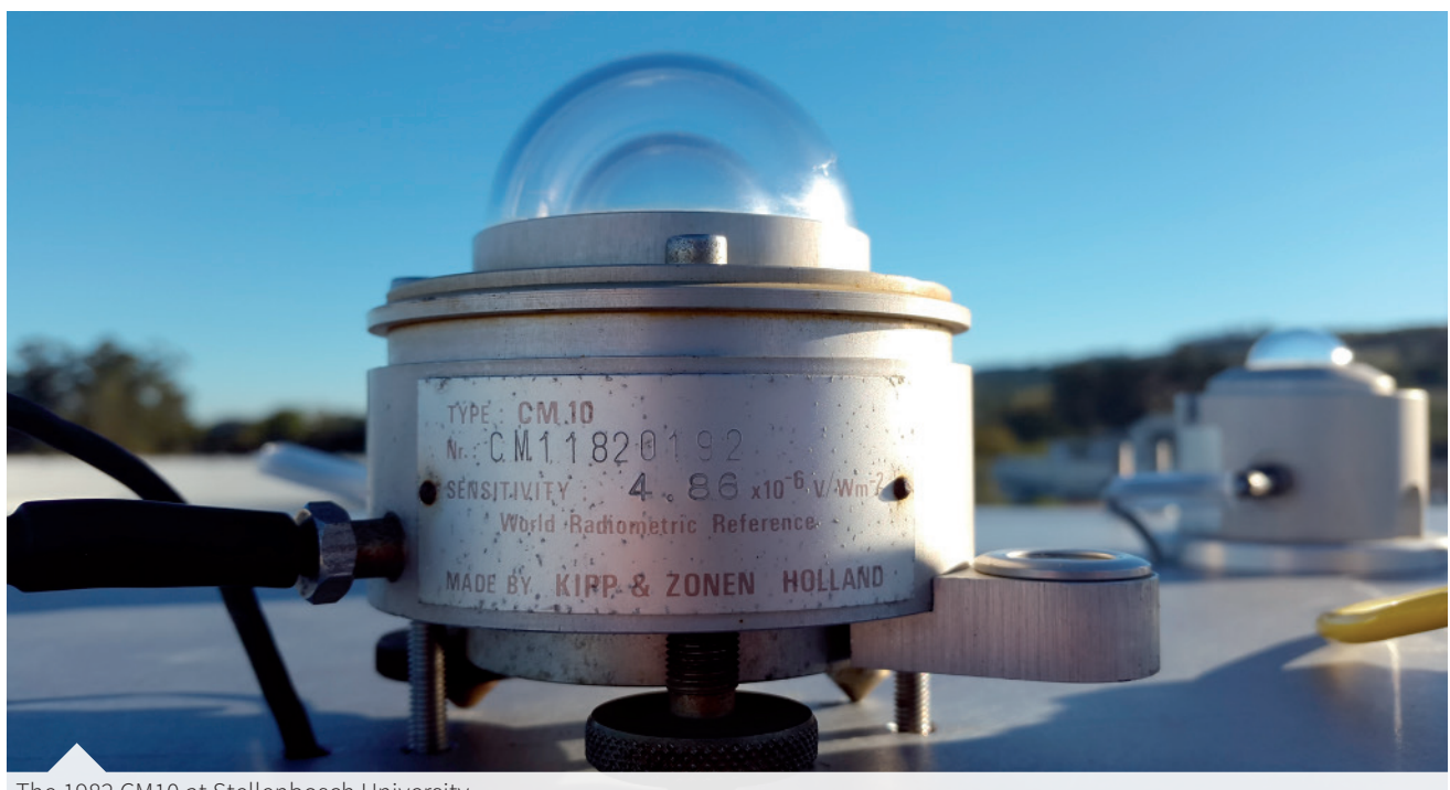
The 1982 CM10 at Stellenbosch University

In the hunt for the oldest Kipp & Zonen pyranometer still in regular use one of the entries that stood out was a CM10 installed in Stellenbosch, South Africa. The CM10 was only made for a short time and was a CM11 without the sun shield, which at that time was white painted aluminium and quite expensive.