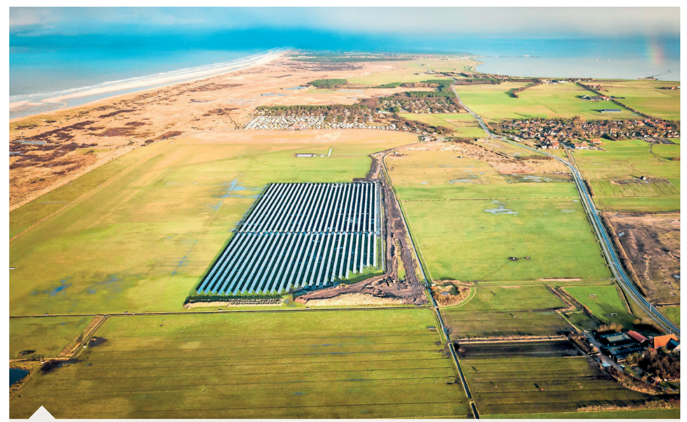
One of the largest PV parks in the Netherlands, on the island of Ameland, installed by Solarcentury Benelux B.V.

The photovoltaic (PV) market is currently showing a rapid growth in the Netherlands. This is partly caused by the change in mindset of private house owners, who are beginning to put PV panels on their rooftops. But, the major part is initiated by new utility-scale PV parks supported by the Dutch government with funding.