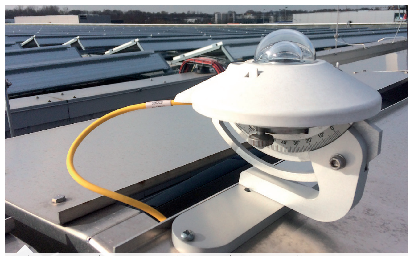
A tilted pyranometer on a roof in Etten-Leur, the Netherlands, a project of SolarAccess Sustainable Energy B.V.