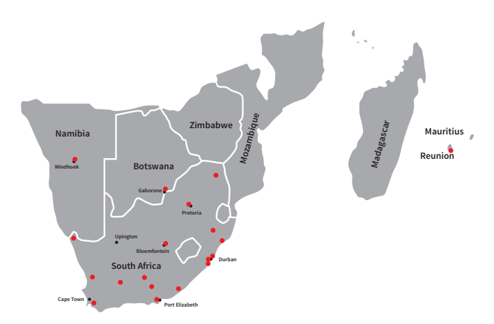
Go to www.sauran.net for the station locations and data

current data for DNI, GHI and DHI. Nearly all the stations in the network use Kipp & Zonen equipment.