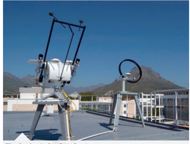
The Sonbesie SAURAN Station

The data from the SAURAN stations, along with some additional data shared voluntarily by solar power developers, were used to produce a validated solar energy resource map of South Africa. This project was funded by the Deutsche Gesellschaft für Internationale Zusammenarbeit (GIZ) and executed by CRSES.