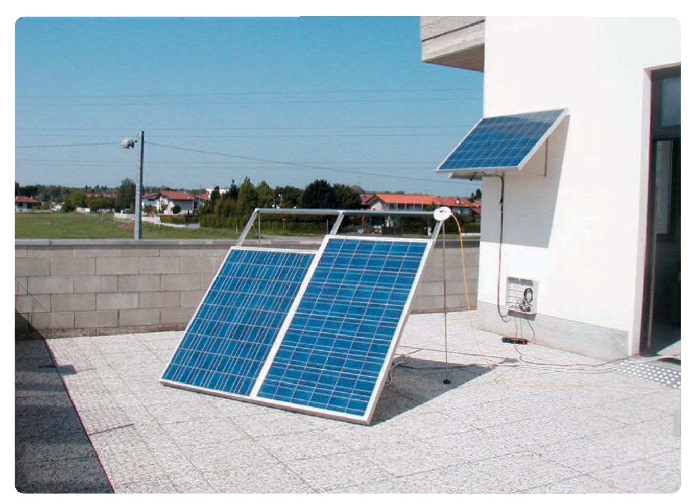
Albarubens performs testing and certification of PV panels for power plant projects

The spectrum of the light is affected by the Air Mass. The Standard Test Conditions are equivalent to a clear sunny day at sea level in mid latitudes with the sun at 45 ° zenith angle.