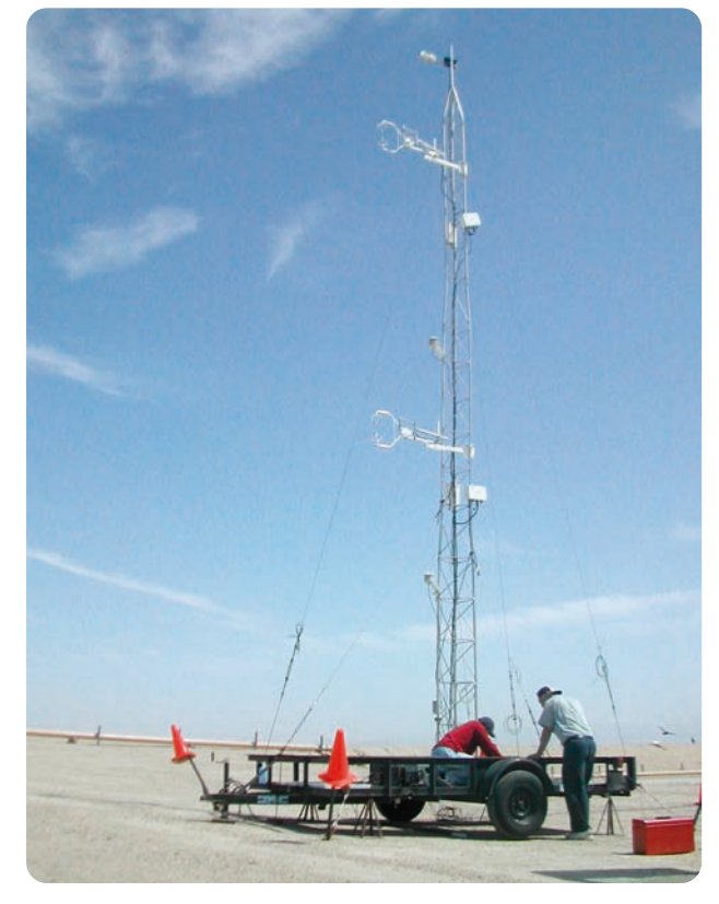
Meteorological tower placed in Lancaster

For more information, a quotation, and system drawings please contact Barry Engelen: be@mierijmeteo.nl ■