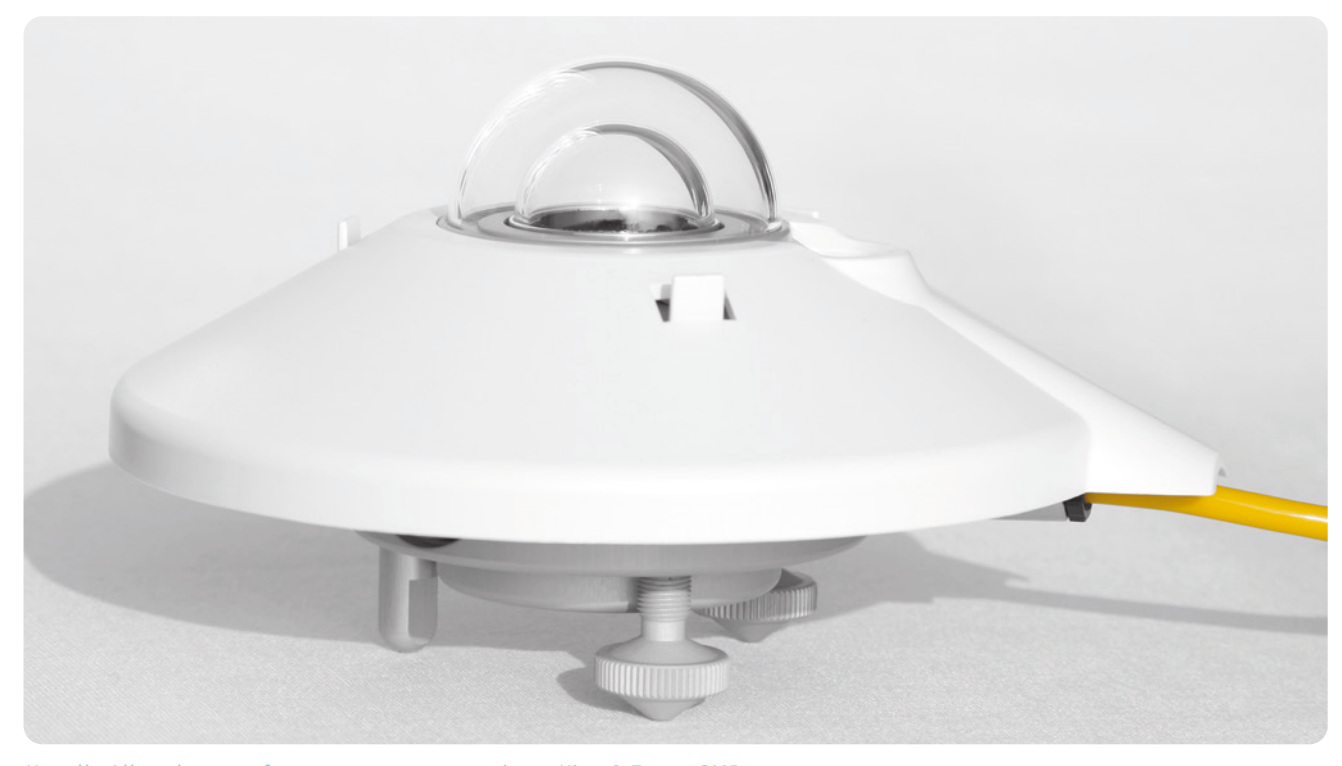
Usually Albarubens performs measurements using a Kipp & Zonen CMP 11 pyranometer

Most manufacturers of PV modules carry out performance tests using a 'solar simulator' based on a Xenon flash lamp and an electronic load with power meter. The main advantage of testing in artificial conditions is the possibility to work at any time and independently of the weather conditions. Also, the solar simulator can be easily integrated into production line testing.